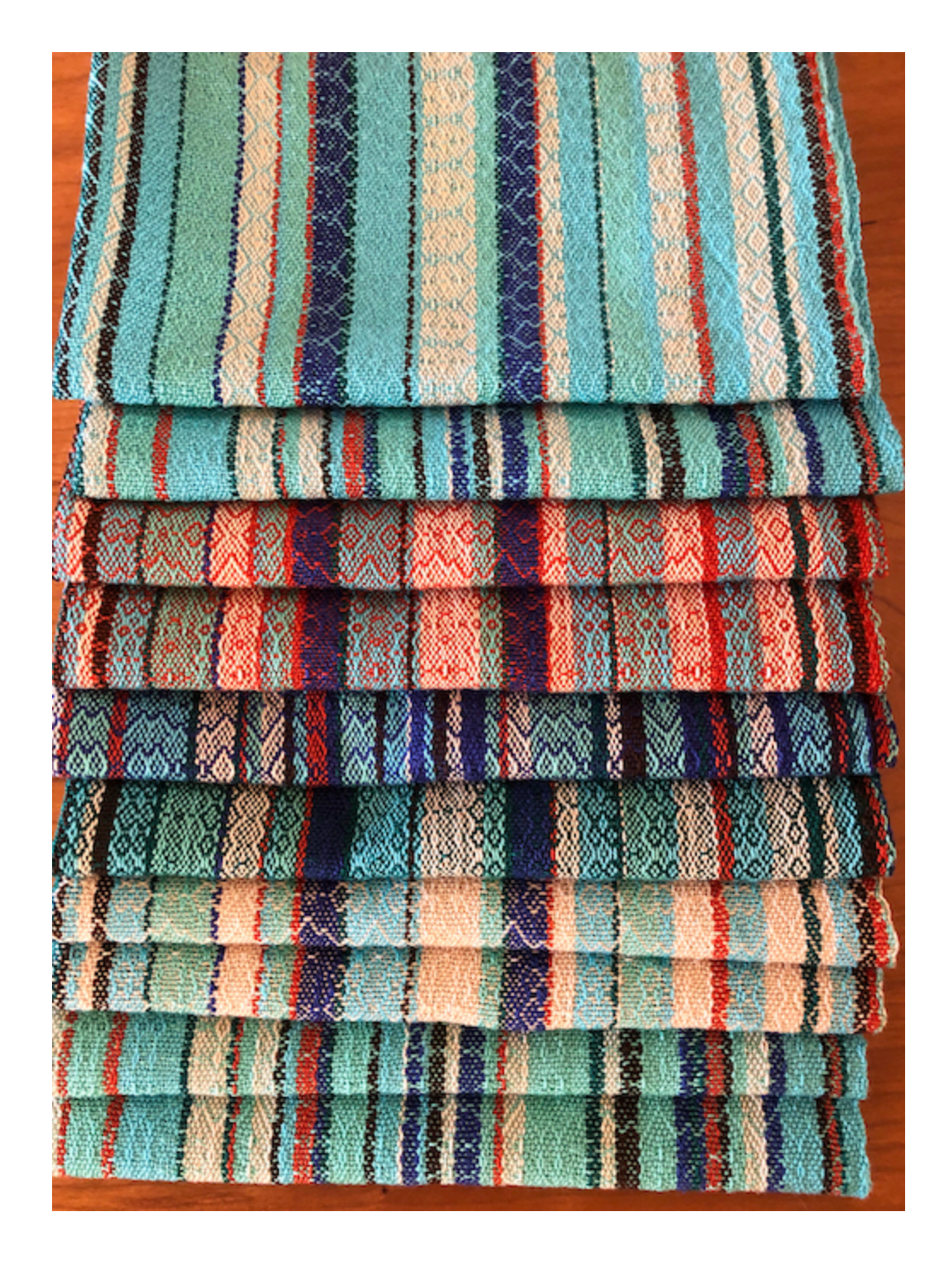
Kathy Semmes is a work in progress and her color palette choice is the Smokey Mountain National Park. She is designing a deflected double weave. Warp is 8/2 cottolin and weft is 20/2 mercerized cotton.