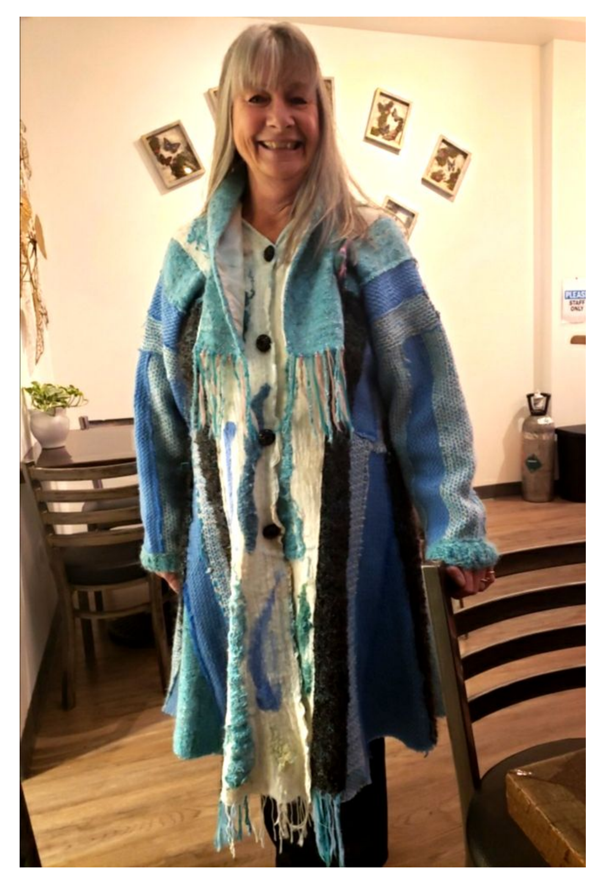
A coat of many weaves, sewn on an old lace tablecloth. The front also has nunofelt.