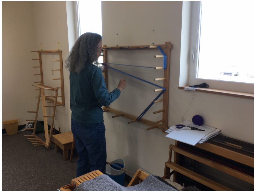
Warping the linen – wall mounted warping board