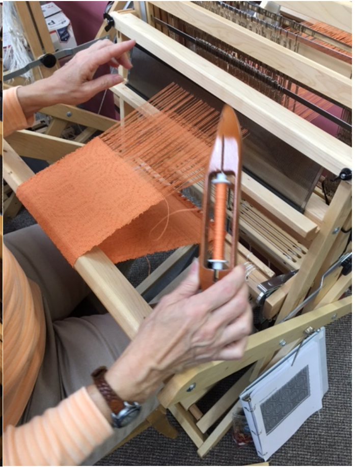
Linen projects in various colors and yarn sizes.