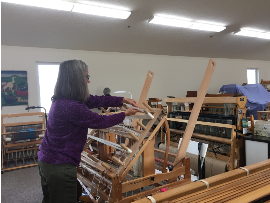
Warping by placing the board on the loom