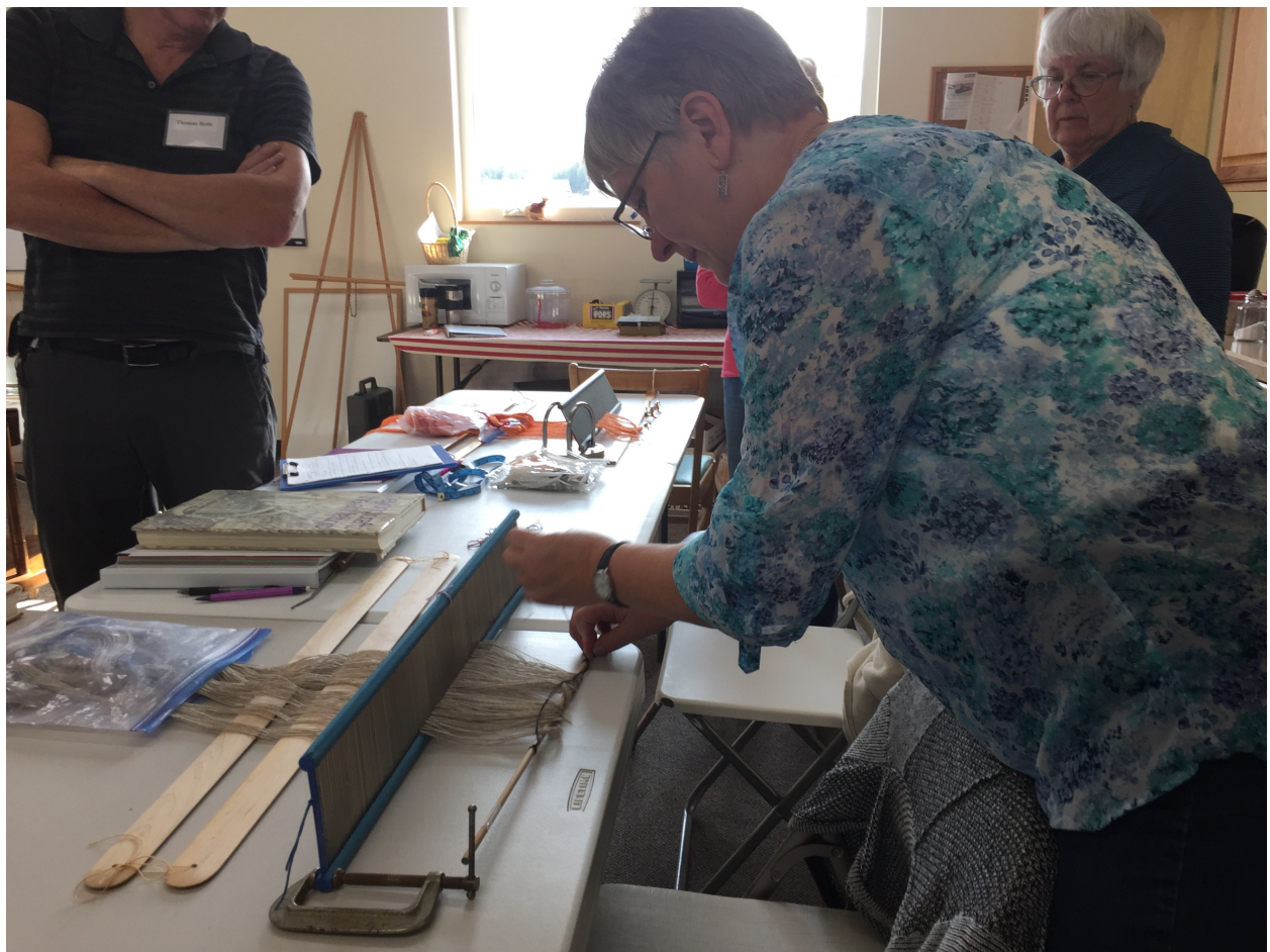
Pre-sleying the reed