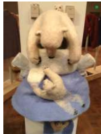
Most Innovative "Save Me Mom" Polar Bear Headpiece