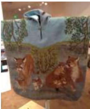
People's Choice (2nd Place) "Moving Day" A Needle Felted Poncho Carol Funnell