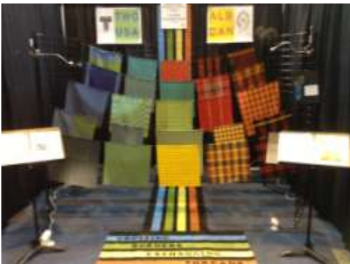
Guild Booth - Best Interpretation of Conference Theme Tacoma Weavers Guild and Hand Weavers, Spinners and Dyers Of Alberta