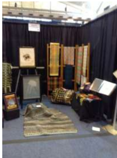
Best Booth by a Guild of Fewer Than 30 Members Nanoose Weavers Guild