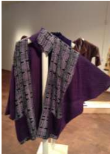
Best Representation Of Conference Theme Woven "haspe" Guatemala jacket - Linda LaMay