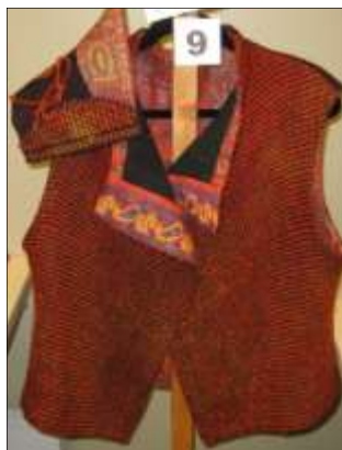
Winner : Best Use of Complex Techniques

Congratulations to all the winners, and many thanks to all who shared their very special items with us. Some of those entries are pictured elsewhere in this issue.