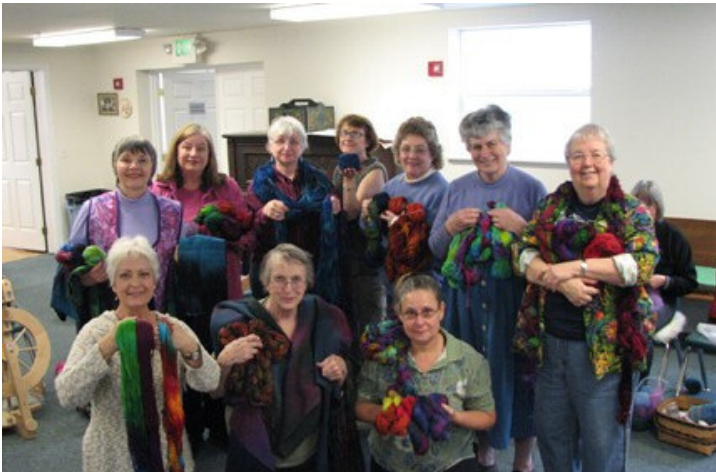
Participants in the Arachne Guild Dye workshop