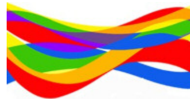
Weaving Waves of Color logo

Entry forms will be available after Sept. 30, 2008 at www.anwg2009.org