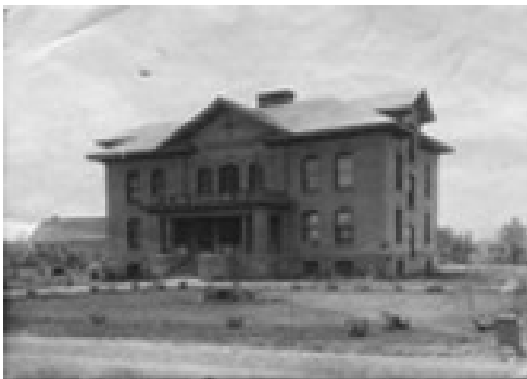
Goller Hall, 1908 Gonzaga University