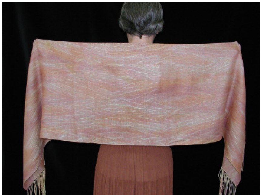
Norma Westcott modeling Tree of Life shawl (Check on the ANWG website for color photos.)