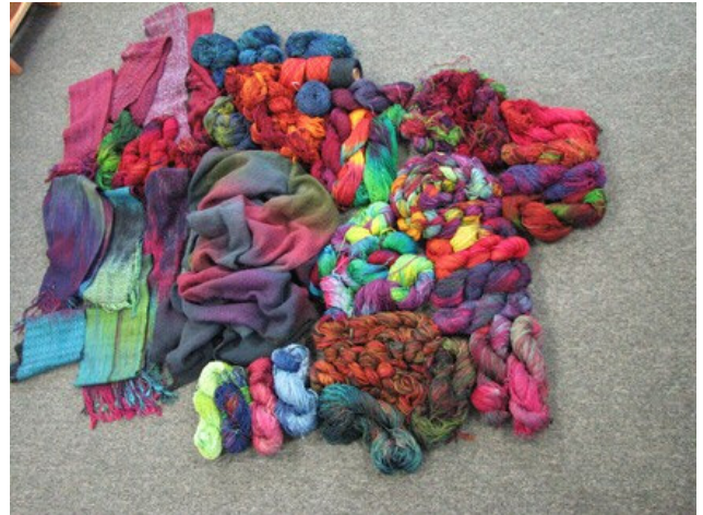
The products from the dye workshop!