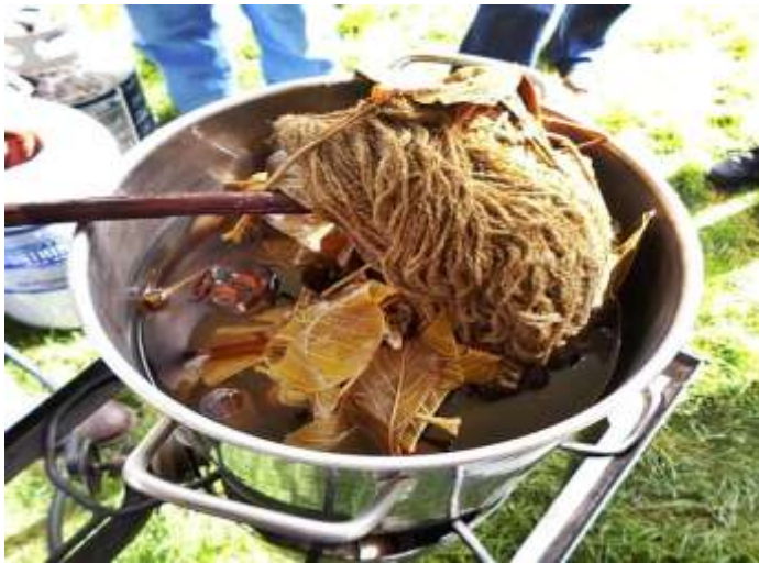
English Walnut dye pot