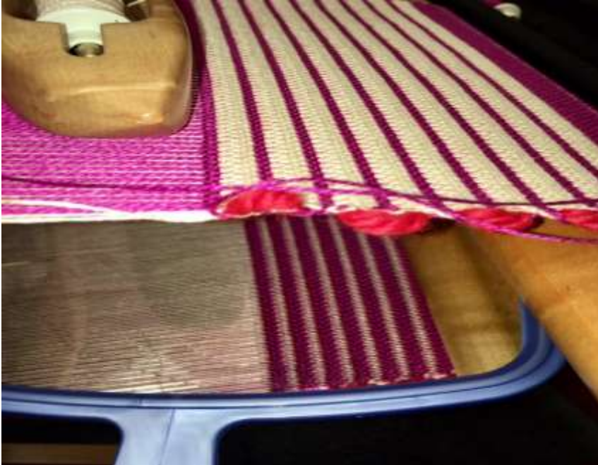
Double Weave Workshop Simple Pique Top and bottom

Centered in south-central WA, in the Tri-Cities = Richland, Kennewick, Pasco. We did need to reschedule this January workshop until February, as you guessed.