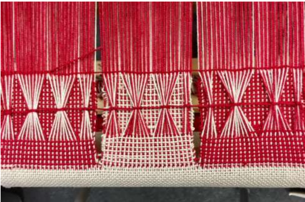
Two tubes become Brooks Bouquet