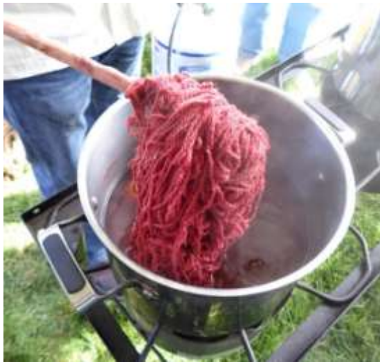
Cochineal dye pot