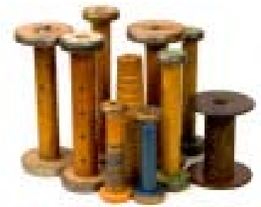
Antique Wooden Bobbins

Materials fee: $24.00 US or CAN equivalent at time of conference.