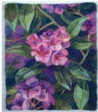
“Rhodies” by Pat Spark

Materials fee: $40.00 US or CAN equivalent